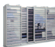
SLIDETRAC Double density & triple density