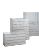
CABINETS Enclosed lockable storage