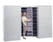
GEMTRAC Super high density Enclosed - lockable